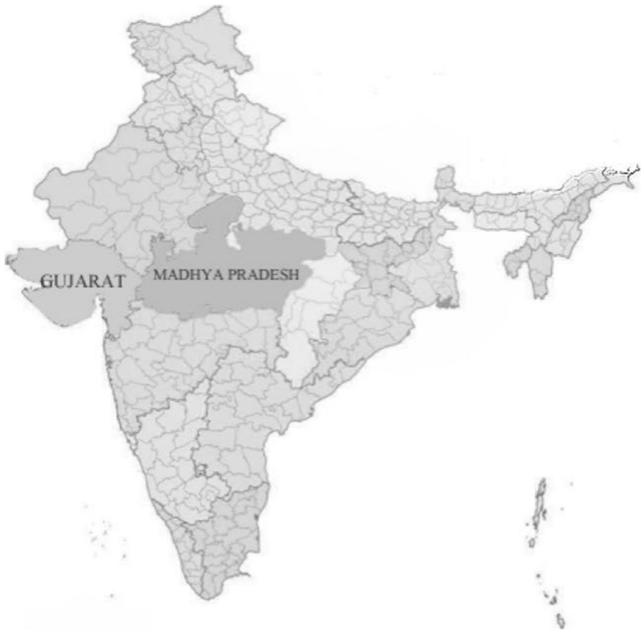
Fig. 1 The mapping of Gujarat and Madhya Pradesh.

economies, India is in urgent need of investments in infrastructure. Despite the increasing efforts that have been put toward improving road construction by the government, India's backward road transportation capacity has constrained its economic growth. Typically, the lack of traffic in rural areas has further widened the gap between urban and rural economic development. In its 12th Five-Year Plan 2012–17, the Indian government [35, 36] has also identified road construction as a vital task and has promised to achieve full coverage of rural roads nationwide by 2020. Therefore, focusing on nonurban road construction projects in India is significant, representative, and practical.